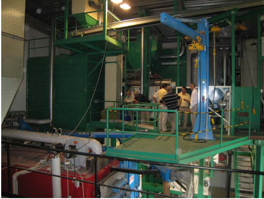
The maintenance platform.