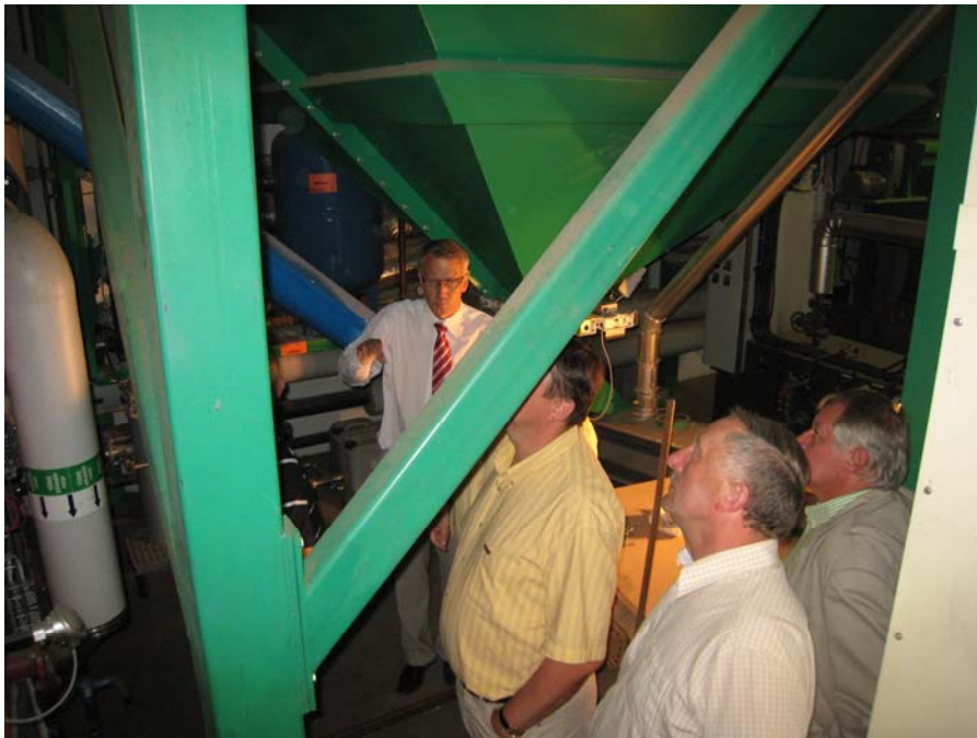
Demonstration of the pellet flow within the facility.