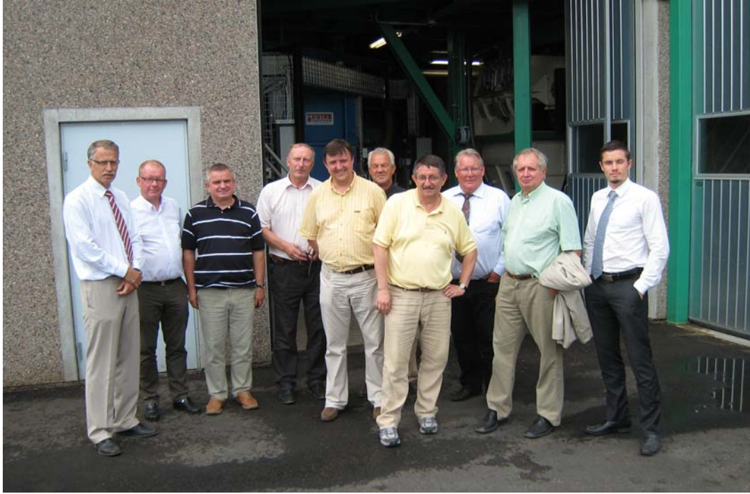
The whole group outside the BIOAGRO facility.