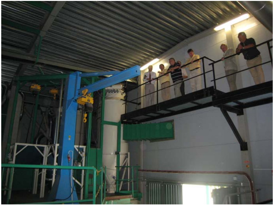
Top view from the demonstration ramp in the BIOAGRO facility.