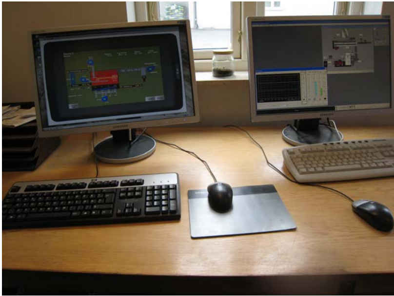
Pelletizer and Furnace control center.