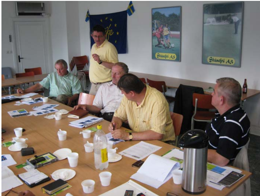
The polish delegation.